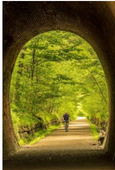
Phipp's Tunnel constructed 1847

The 6.7 miles of trail in Holliston have been completed with a hard-packed, stone dust surface, about 10 feet wide.