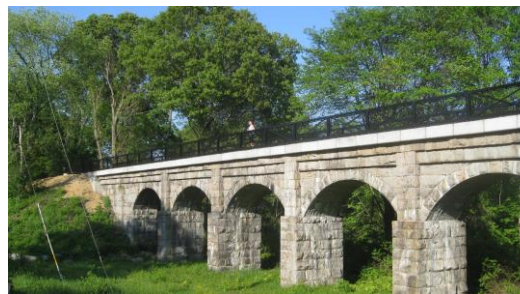
Bogastow Brook Viaduct, constructed 1846